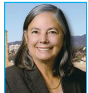
Senator Fran Pavley